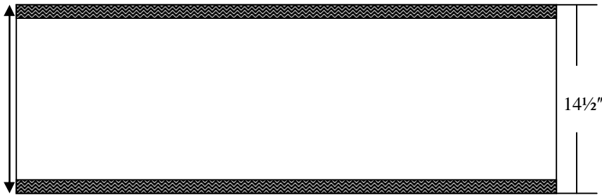
fig. 1 Panel A – make 2

Use the 2¾" strip of fabric #1 and one 1¾" strip of fabric #3 to make a B panel. See figure 2. Press the seam allowances as shown by the arrow. Again, measure to check for accuracy.